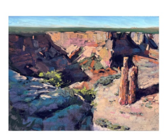
Laura E Pollak ANCIENT COLUMNS Pastel 9 x 12 NFS